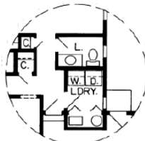
opt. slab/ crawlspace