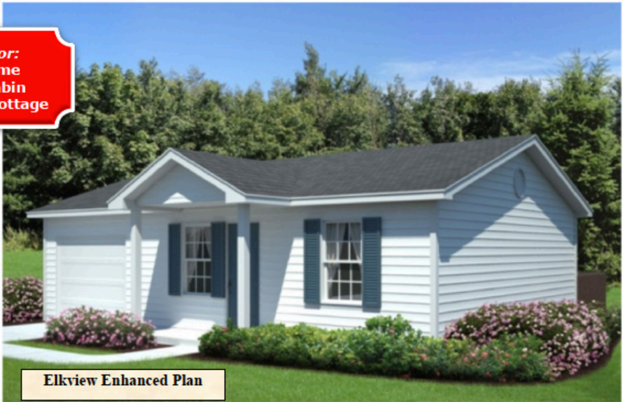
Elkview Enhanced Plan