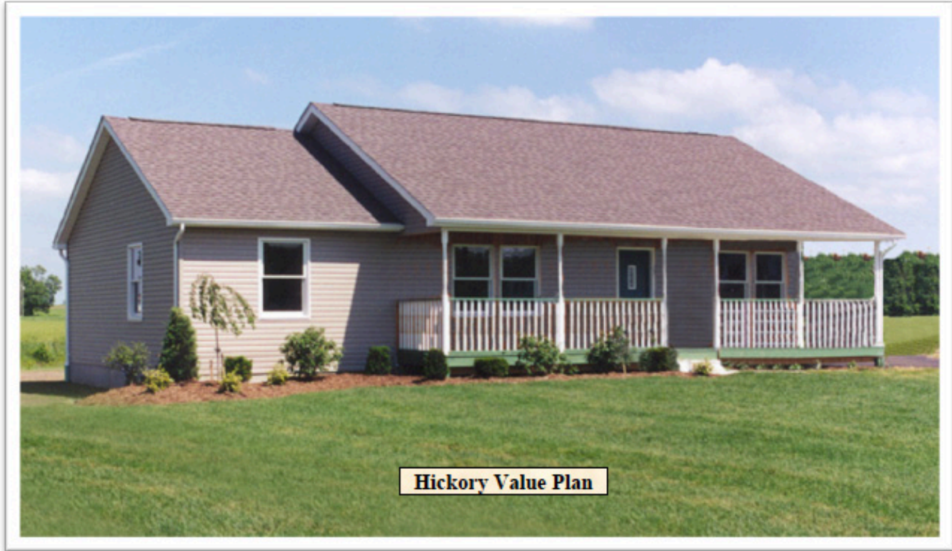
Hickory Value Plan

1,456 - 1,492 sq. ft. Affordable Collection