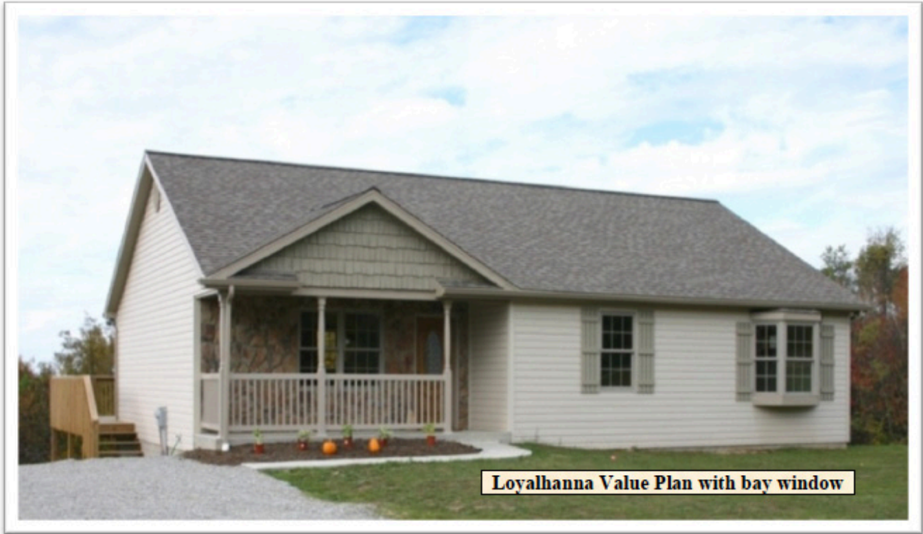
Loyalhanna Value Plan with bay window