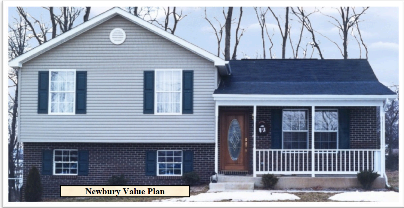
Newbury Value Plan