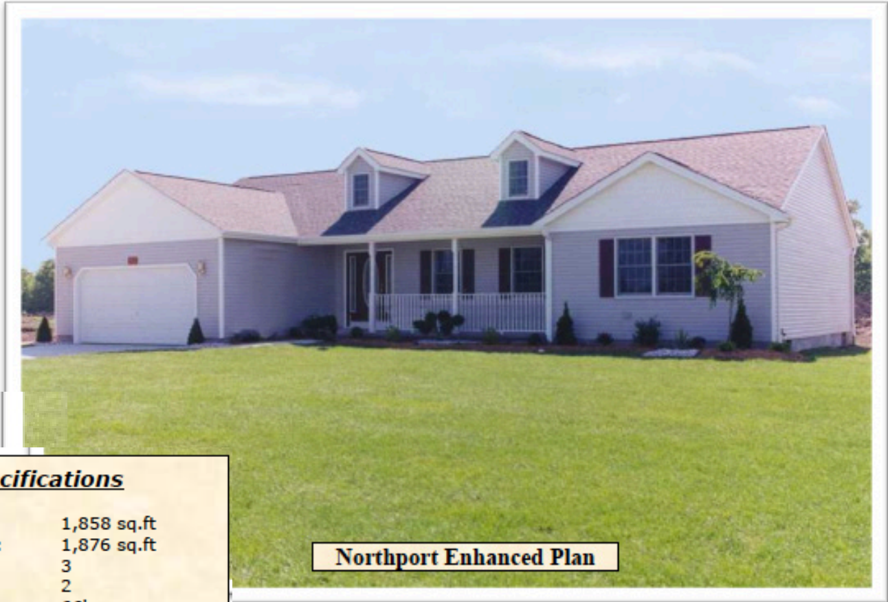
Northport Enhanced Plan