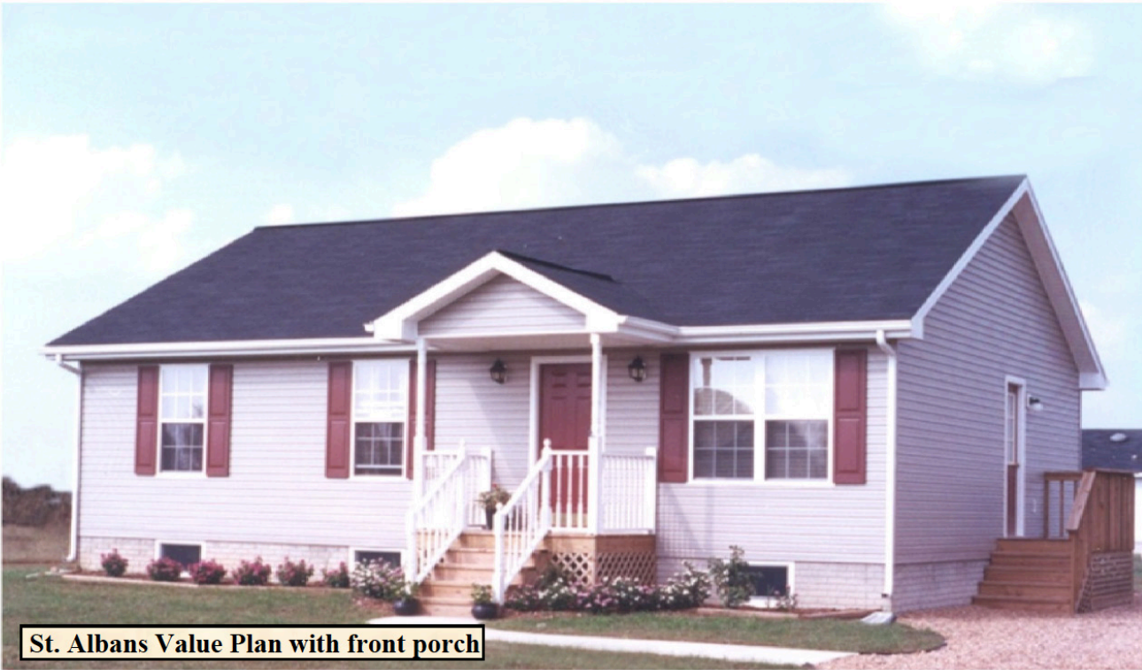
St. Albans Value Plan with front porch

1,120 - 1,132 sq. ft. Affordable Collection